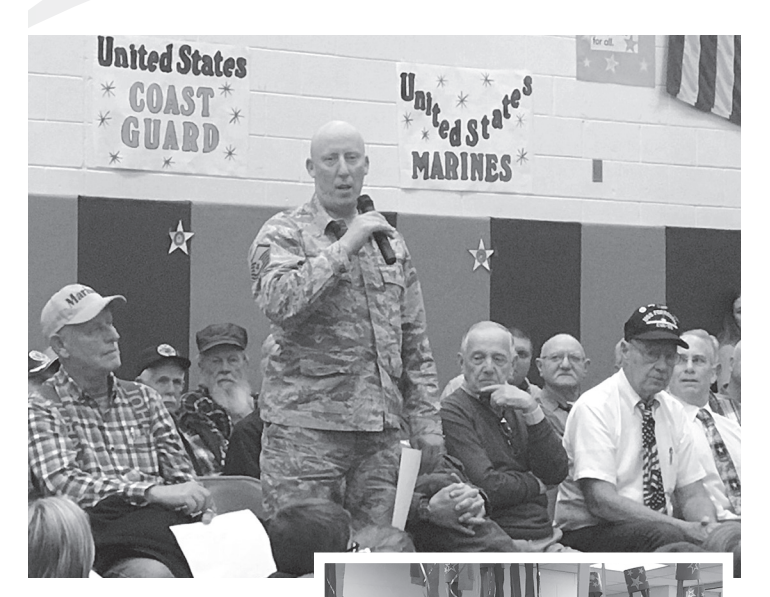
Every November for Veterans Day, Ryder and Radez Elementary Schools conduct special assemblies to honor family, friends, and community members who service our country.